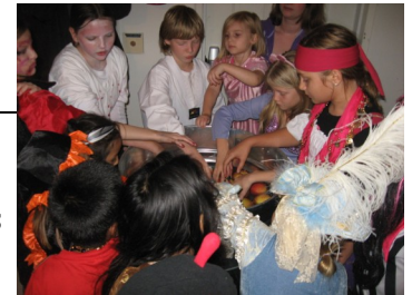
Apple Grab Contest